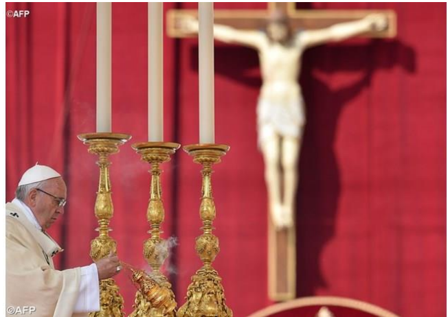
Pope Francis celebrates Mass for Divine Mercy Sunday in St Peter's Square, 3 April 2016. – AFP 03/04/2016 (Vatican Radio)

"Being apostles of mercy means touching and soothing the wounds that today afflict the bodies and souls of many of our brothers and sisters."