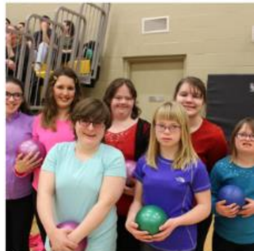
These lovely ladies entertained with a dance routine using a ball, ribbon and hoop

The Knights of Columbus of Burlington and Oakville sponsored and participated in a province-wide flag relay to help raise awareness of Special Olympics Ontario. At the flag-raising ceremony, held at Burlington City Hall on March 7, Deputy Mayor Councillor Blair Lancaster proclaimed March 7 to 13 Special Olympics Week in Burlington. The passing of the flag on to Oakville happened at the Special Olympics Athletes Night held at the Haber Rec Centre on March 10. Athletes from both Oakville and Burlington, representatives from both city councils, the four councils of the Knights of Columbus, Halton Police and Burlington Firefighters were all out for an evening of basketball, floor hockey and fun. The Special Olympics, over the past 40 years, have become the world's largest movement dedicated to promoting respect, acceptance, inclusion and human dignity for people with intellectual disabilities through sports.